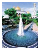
Jane' Asr Hassanil Bolkiah Mosque in Brunei